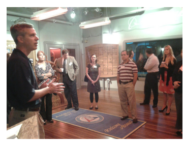
National Flight Academy, "Ambition"